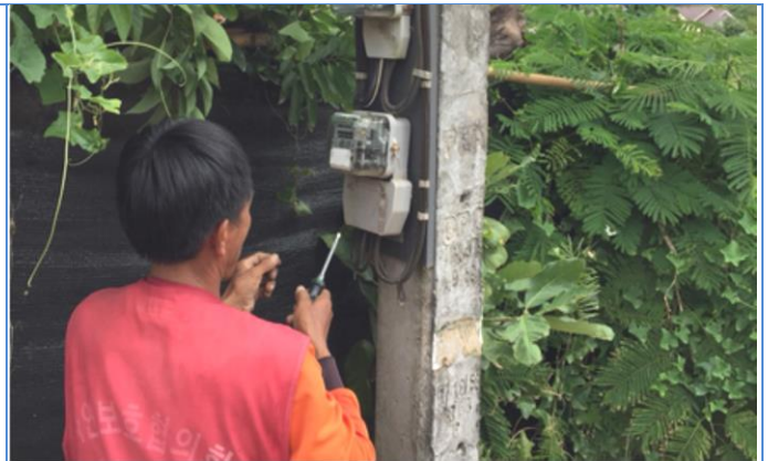
Electrician Installing New Service for Recording Studio