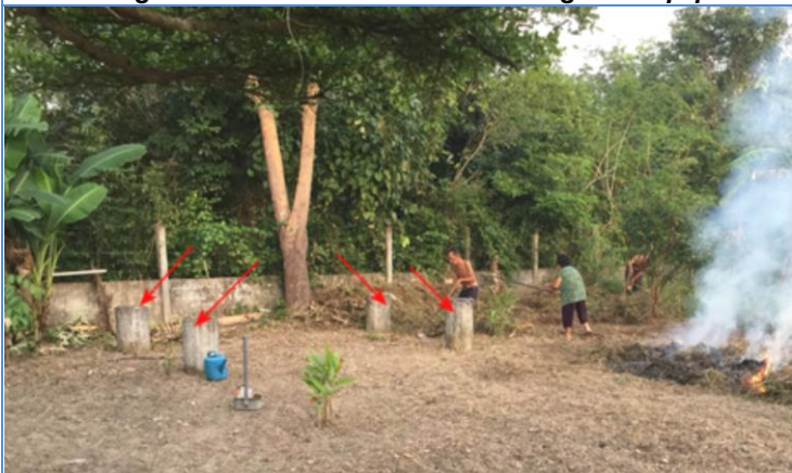
Clearing Brush From Around Baaw Ter's Radio Tower Base