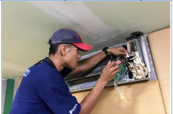
Air Conditioner Tech Checking Out A/C Controller Board